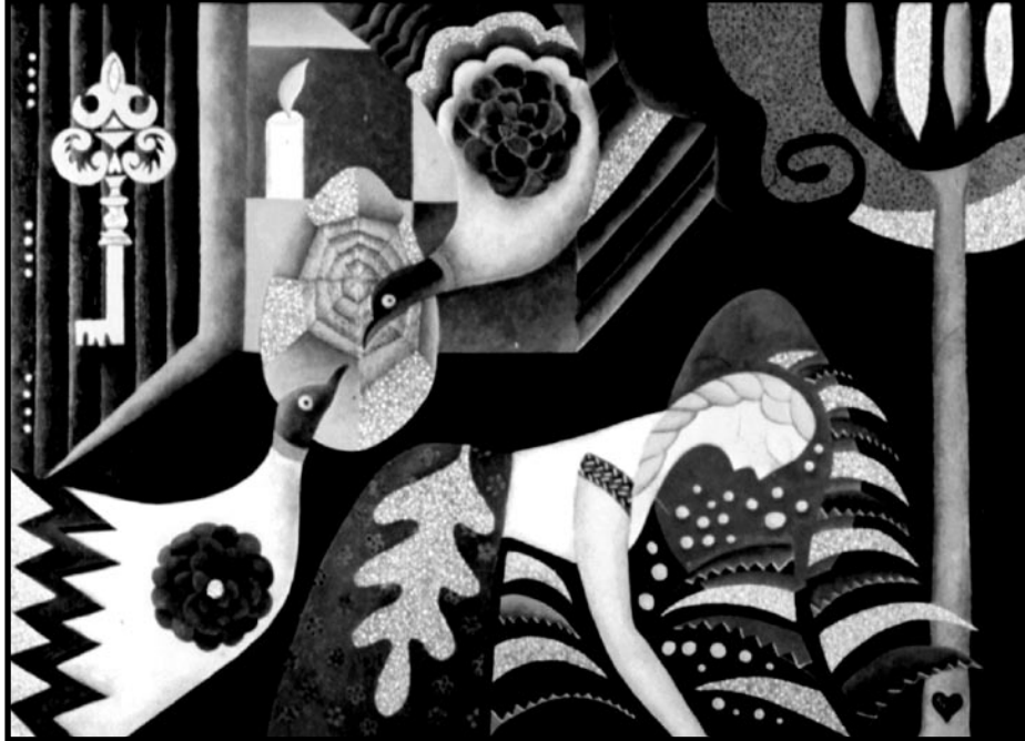
Painting by Aka Pereyma

The Scarab Club of Detroit and the Ukrainian American Archives & Museum of Detroit present an exhibit featuring artists from the United States, Canada, and Ukraine